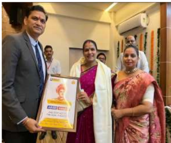
Welcome the Chief Guest