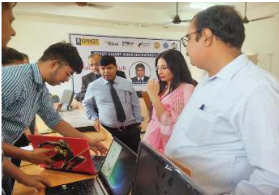
Internal Smart India Hackathon (SIH) 2022 on 24-25 March 2022