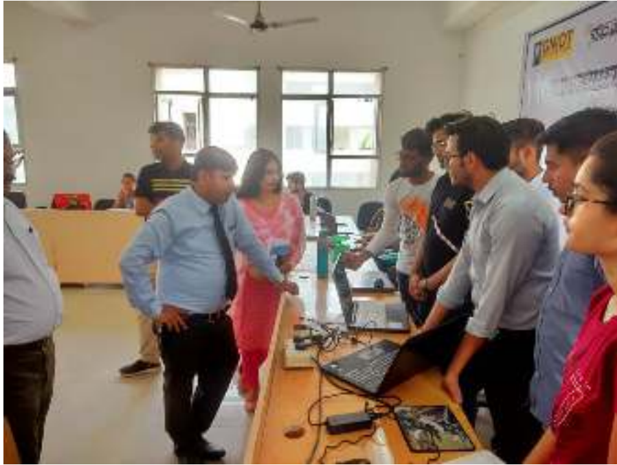
Internal Smart India Hackathon (SIH) 2022 on 24-25 March 2022