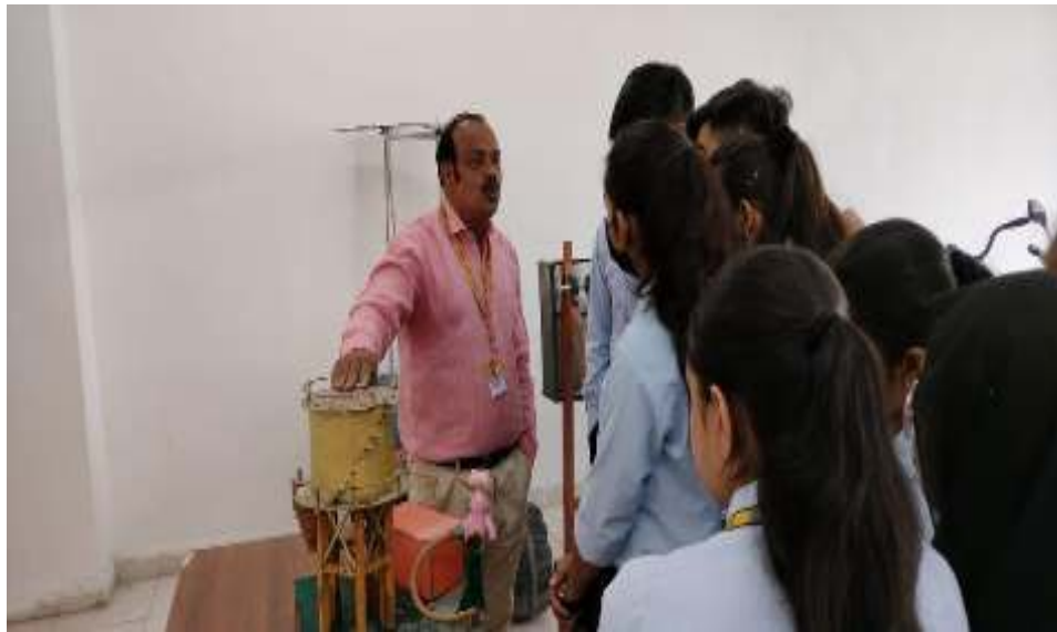
Incubation Center Visit by Students of GIPS, Greater Noida as Industrial Visit