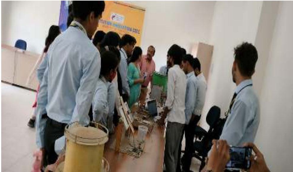
Incubation Center Visit by Students of GIPS, Greater Noida as Industrial Visit