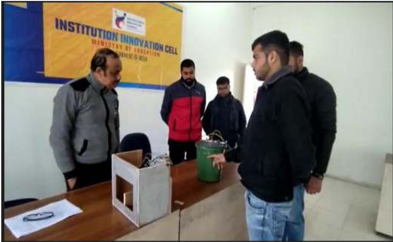
Regular Activities of Incubation Cell